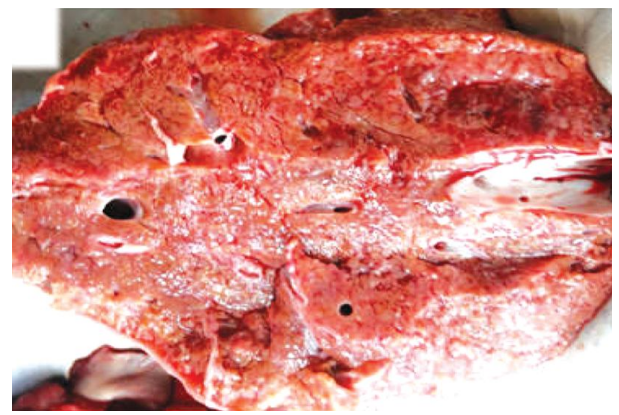
Fig. 2: Gross image of cut liver surface showing nodular subdivision of liver parenchyma.

drain sites or implantation of pacemaker device.